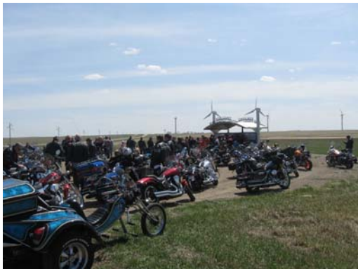
The stop at the wind turbines gave everyone a chance to stop and chat.

The annual charity ride for the Boys and Girls Club turned out to be a beautiful day with a bunch of people showing up ready for a ride. We were able to give the Boys and Girls Club $740 and they gave us a great ride and a great meal.